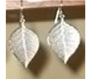
silver earrings ref 620