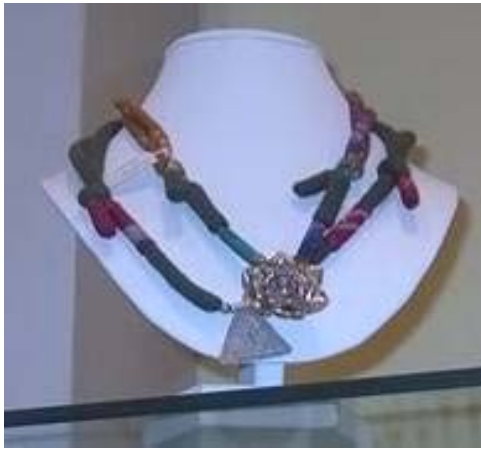
Silver necklaces ref SJ134 ref SJ135

Any design you want can be made to meet your needs and requirements