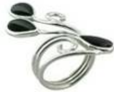
Sterling silver ring black sea shell ref 428