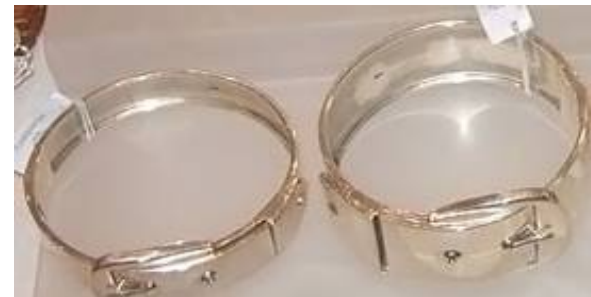
Sterling silver bracelets ref 202 ref 203