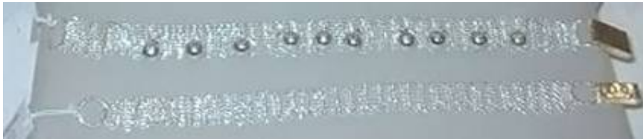
Sterling silver bracelets ref 220 ref 221