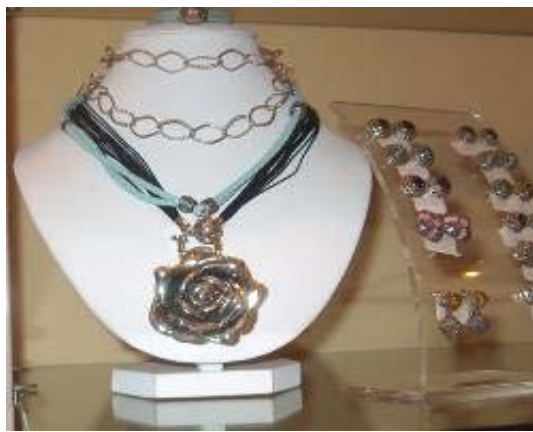
Silver kettle necklace refSJ153 Rose-shaped silver necklace ref SJ152