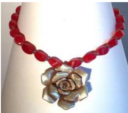
Carnelian beads and silver rose ref163 also available with Topaze semi-precious stones