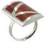
Sterling silver ring Red Coral ref 401