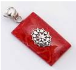
Silver sterling pendant red coral Ref 336