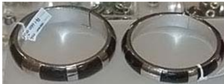
Sterling silver bracelets onyx stone ref 212 ref 213