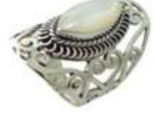
Sterling silver ring oval sea shell ref 415