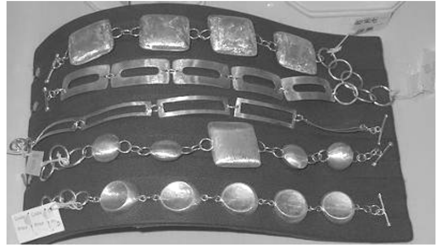
Sterling silver bracelets some with freshwater pearls ref 225 ref 226 ref 227 ref 228 ref 229