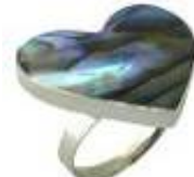
Sterling silver ring sea shell and resin ref 413