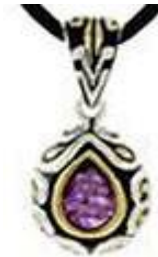
Silver sterling pendant amethyst stone Ref 329