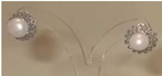
Fresh river pearls ref628