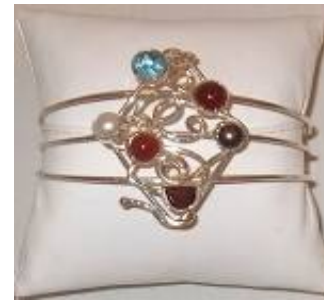
Sterling silver bracelet various stones Ref 233