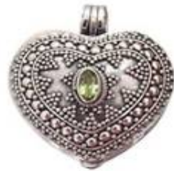
Silver sterling heart-shaped pendant peridot stone Ref 303