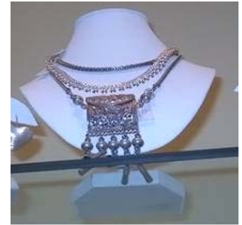
Silver necklaces ref SJ137 ref SJ138 ref SJ138