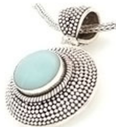
Silver sterling pendant blue quartzine Ref 318