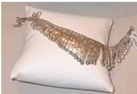
Sterling silver bracelet Ref 236