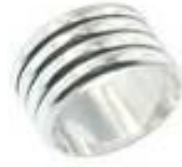
Sterling silver ring ref 407