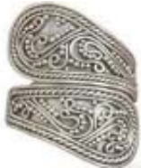
Sterling silver ring with carvings ref432