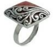
Sterling silver ring oval Red coral and carvings ref 430