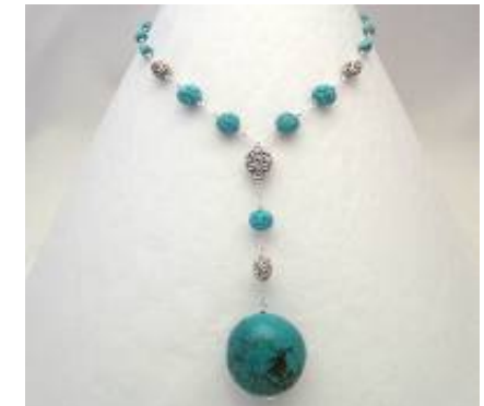
Silver necklace with topaze and silver beads ref165