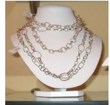
Silver chain necklaces ref SJ160 ref SJ161 ref SJ162