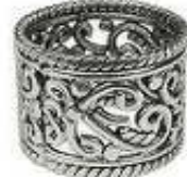
Sterling silver ring with carvings ref 418