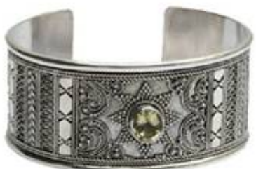
Sterling silver bangle with carvings Ref 253