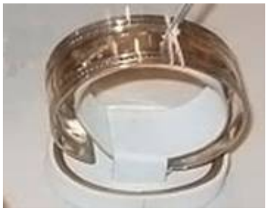
Sterling silver bangle onyx stones Ref 241