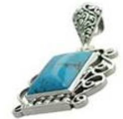
Silver sterling pendant turquoise stone Ref 330