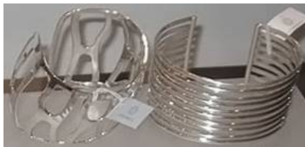
Sterling silver bracelets ref 204 ref 205