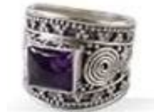
Sterling silver ring with carvings Amethyst stone ref 419