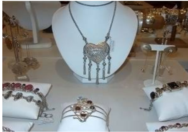
Heart-shaped silver necklace ref SJ136