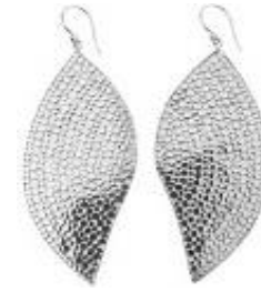
Silver earrings ref608