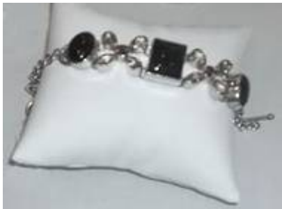
Sterling silver bracelet onyx stones Ref 230