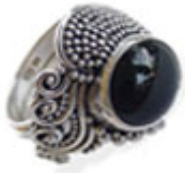
Sterling silver ring with carvings oval black onyx f431