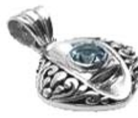
Silver sterling pendant with carvings turquoise stone Ref 304