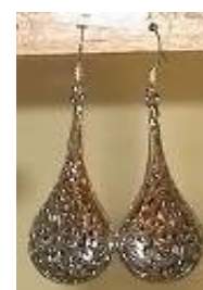
Silver earrings ref645