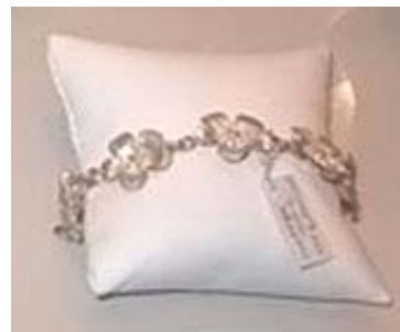
Sterling silver bracelet adorned with flowers Ref 237