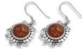
Amber stones ref614