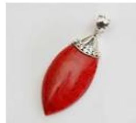
Silver sterling pendant red coral Ref 338