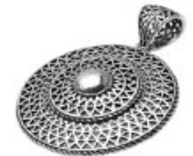
Silver sterling round heart with carvings Ref 335