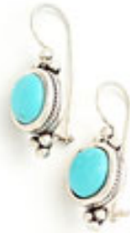
Turquoise stones ref607