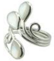
Sterling silver ring Mother of Pearl ref 4#)