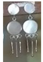
sea shell ref 630