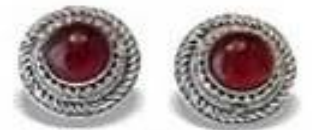
Camelian stones ref625