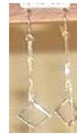
Silver earrings ref635