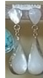
sea shell ref 619