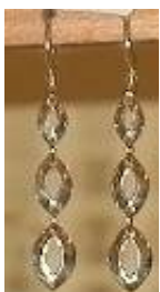
Silver earrings ref638