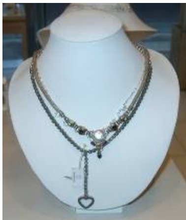
Silver necklaces ref SJ139 ref SJ140