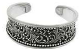
Sterling silver bangle with carvings Ref 252