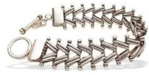
Sterling silver bracelet Ref 256