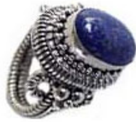
Sterling silver ring with carvings blue lapis ref427