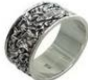
Sterling silver ring with carvings ref 417