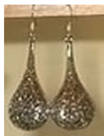
Silver earrings ref643