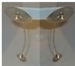
sea shell ref 639