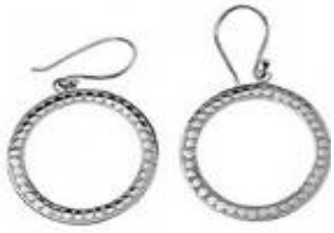
Silver earrings ref601