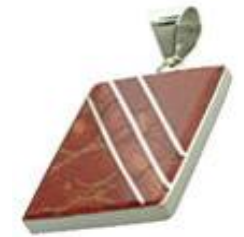
Silver sterling pendant coral Ref 336