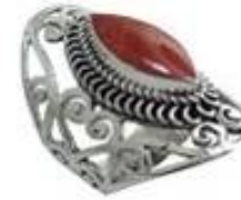
Sterling silver ring oval Red coral 17x7 mm marqiz ref429