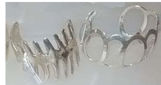
Sterling silver bangles ref 209 ref 210