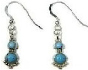
Turquoise stones ref602