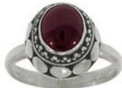
Sterling silver ring oval garnet ref433