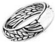
Sterling silver ring with carvings ref 416