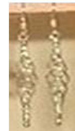
Silver earrings ref640