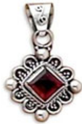
Silver sterling pendant faceted garnet stone Ref 327