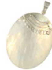
Silver sterling pendant mother of pearl sea shell Ref 324