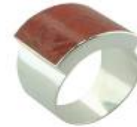
Sterling silver ring Red Coral ref 404