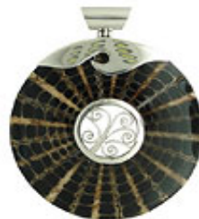
Silver sterling pendant sea shell and resin Ref 333