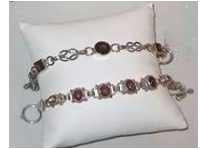
Sterling silver bracelet garnet stones Ref 234 ref 235