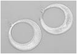
Silver earrings ref621