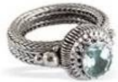
Sterling silver ring with carvings Topaz stone ref 411