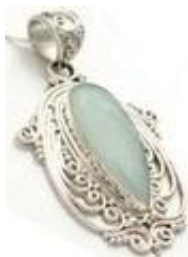
Silver sterling pendant blue quartzine Ref 318