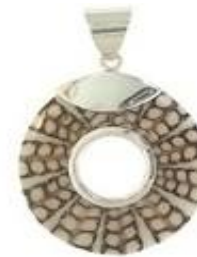
Silver sterling round-shaped pendant sea shell Ref 304