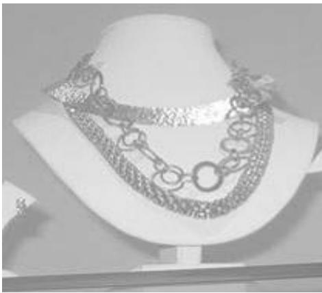
Silver necklaces ref SJ148 ref SJ149 ref SJ150