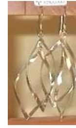
Silver earrings ref641