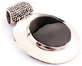
Silver sterling pendant black stone Ref 322