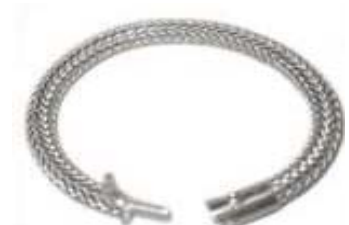
Sterling silver bangle Ref 248