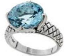
Sterling silver ring with carvings oval blue topaz ref 435