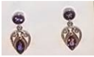
Amethyst stones ref622