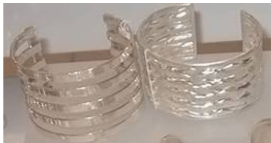
Sterling silver bangles ref 201 ref 202