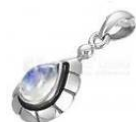
Silver sterling pendant moonstone Ref 320