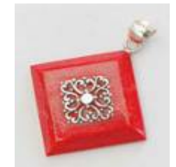
Silver sterling pendant red coral Ref 340