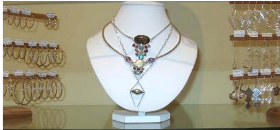
Silver necklaces ref SJ141 ref SJ142 ref SJ143