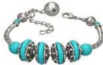
Sterling silver bracelet Turquoise stones Ref 250