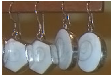
sea shell ref 633 ref634