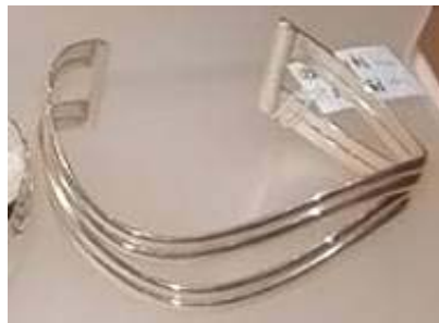
Sterling silver bracelet ref 206