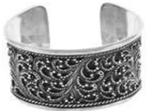
Sterling silver bangle with carvings Ref 245