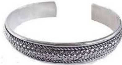
Sterling silver bangle with carvings Ref 246