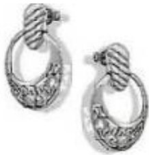
Silver earrings ref611