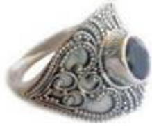
Sterling silver ring with carvings blue lapis ref427