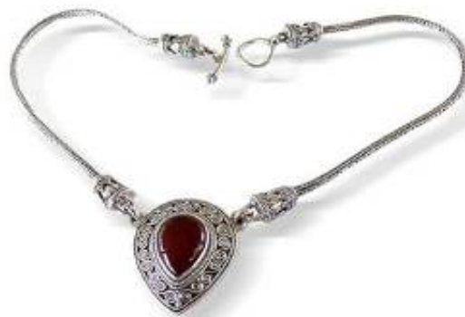
Silver necklace with carnelian pear-shaped pearl ref164