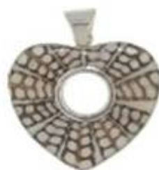
Silver sterling heart-shaped pendant sea shell Ref 303