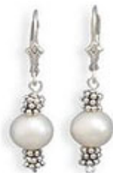
Fresh river pearl and silver ref617