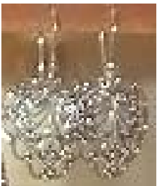
Silver earrings ref637