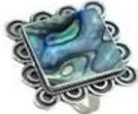
Sterling silver ring sea shell and resin ref 412