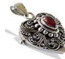
Silver sterling carved heart pendant garnet stone Ref 305