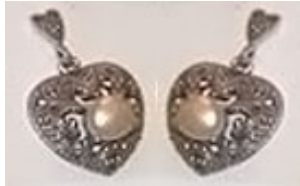
Pearl and silver ref623