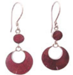
Silver and coral ref605