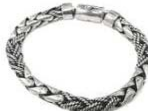
Sterling silver bracelet Ref 251