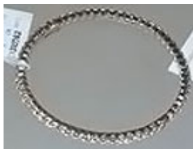
Sterling silver bracelet ref 211