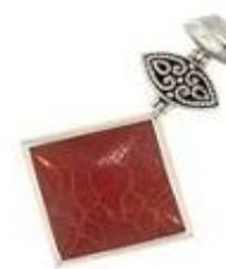
Silver sterling pendant red coral Ref 319