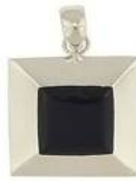
Silver sterling pendant sea shell Ref 313