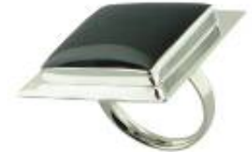
Sterling silver ring black sea shell ref 410