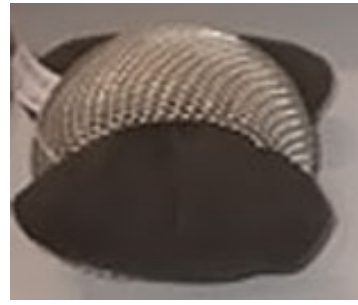
Sterling silver bangle Ref 242