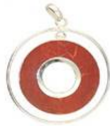
Silver sterling round-shaped pendant white red coral Ref 323