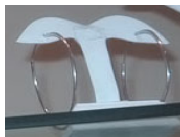
sea shell ref 644