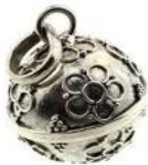
Silver sterling ball-shaped pendant with carved flowers Ref 301