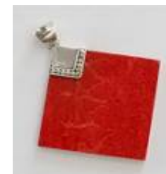
Silver sterling pendant red coral Ref 339