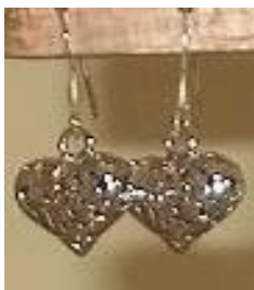
Silver earrings ref642