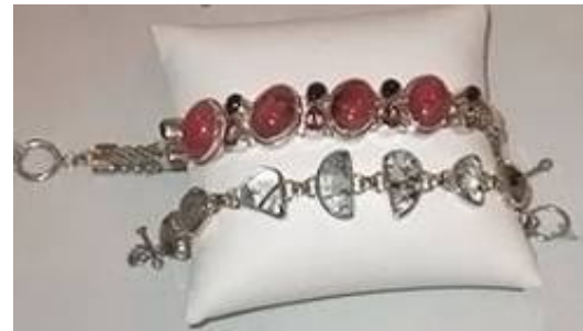
2 sterling silver bracelets Ref 238 ref 239