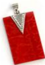
Silver sterling pendant red coral Ref 318