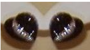
Onyx stones ref616