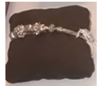
Sterling silver bracelet adorned with a flower Ref 240