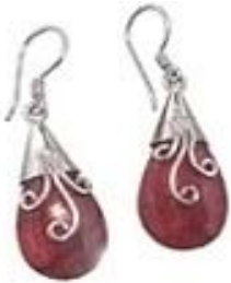
Silver and coral ref610