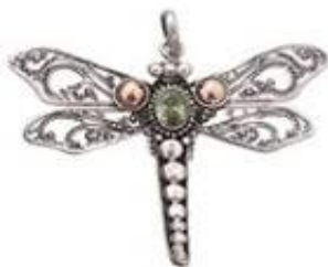
Silver sterling dragonfly pendant garnet stone Ref 302