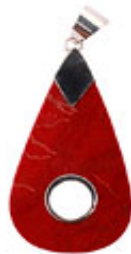
Silver sterling red pear pendant sea shell Ref 332