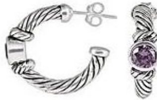
Amethyst stone ref612