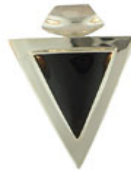
Silver sterling triangle-shaped pendant black sea shell Ref 328