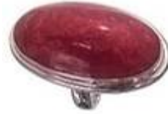
Sterling silver ring Red Coral ref 403