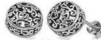
Silver earrings ref624