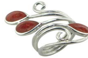
Sterling silver ring red Coral ref 429