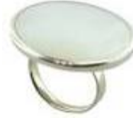
Sterling silver ring mother of pearl ref 408