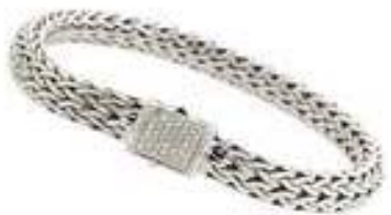
Sterling silver bracelet Ref 249