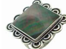
Sterling silver ring sea shell ref 414