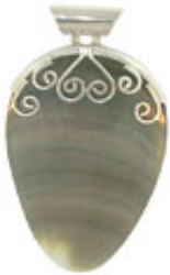
Silver sterling pendant green seashell Ref 326