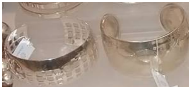
Sterling silver bangles ref 207 ref 208