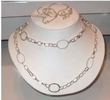
Silver chains necklaces ref SJ157 ref SJ158