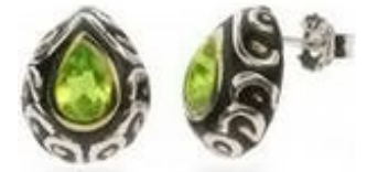
Peridot stones ref615