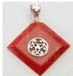
Silver sterling pendant red coral Ref 337