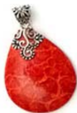
Silver sterling pear-shaped pendant red coral Ref 319