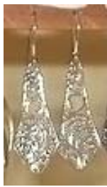
Silver earrings ref632