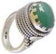
Sterling silver ring with carvings oval Green Aventurin f426