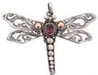
Silver sterling dragon fly pendant garnet stone Ref 301