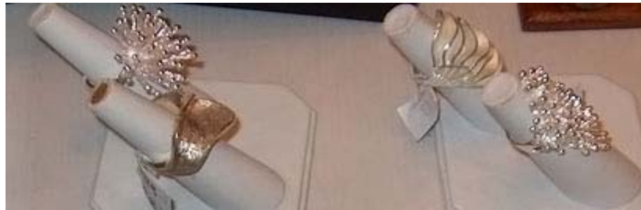
Sterling silver rings ref441 ref442 ref443 ref 444