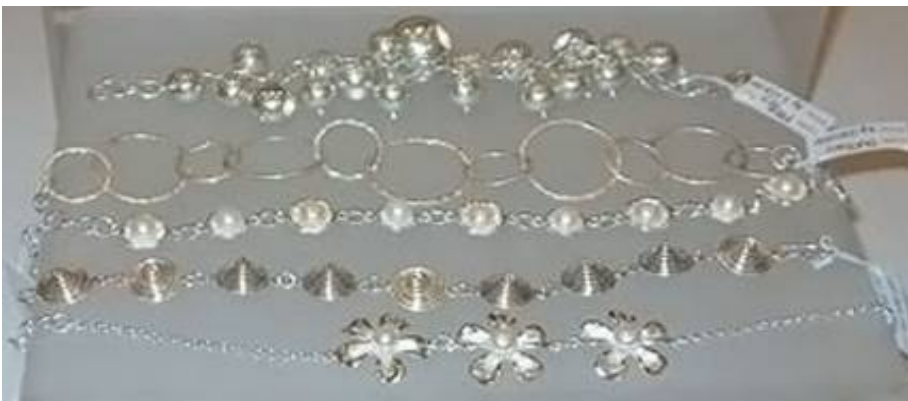
Sterling silver bracelets some with freshwater pearls ref 215 ref 216 ref 217 ref 218 ref 219