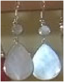
sea shell ref 626