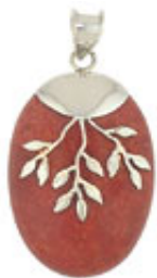
Silver sterling red pear pendant sea shell and leaves Ref 332