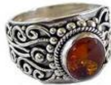
Sterling silver ring with carvings oval amber ref428