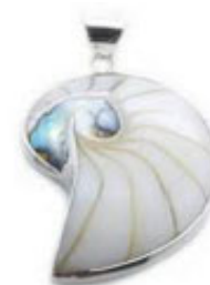
Silver sterling shell-shaped pendant Ref 314