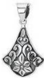
Silver sterling pendant with flower carving Ref 302