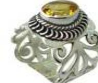
Sterling silver ring with carvings oval Citrin stone ref 419