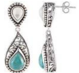
Topaz stones ref609