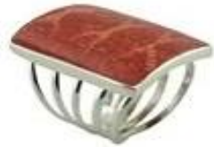
Sterling silver ring Red Coral ref 402