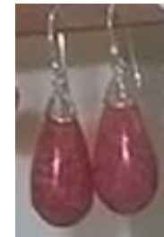
Red Coral pear ref629