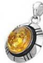
Silver sterling pendant amber stone Ref 315