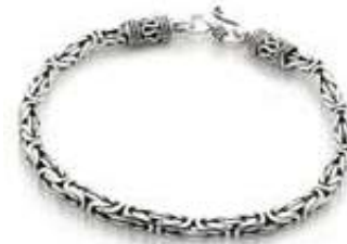
Sterling silver bracelet Ref 247