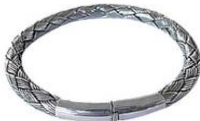
Sterling silver bracelet Ref 254