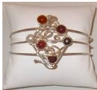
Sterling silver bracelet garnet stones Ref 231