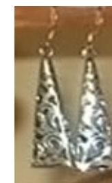
Silver earrings ref641

Pierres semi précieuses utilisées: ambre (amber), améthyste (amethyst), carnelian (carnelian), citrine (citrine), garnet (garnet), green aventurine, lapis (lapis), moonstone (pierre de lune), peridot (peridot), quartzine (quartzine), topaze (topaz), turquoise (turquoise). Sont également du nacre (pearl of mother) et de la résine.