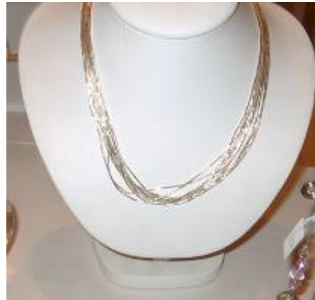
Silver necklace ref SJ159