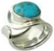
Sterling silver ring Turquoise stone ref 406