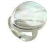
Sterling silver ring mother of pearl ref 409