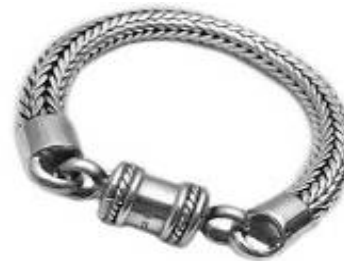
Sterling silver bracelet Ref 255