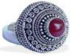
Sterling silver ring round Carnelian stone ref 420