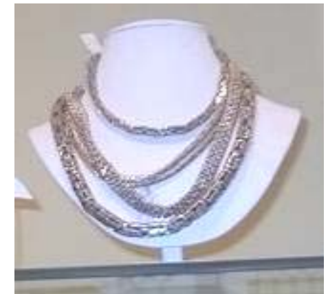
Silver chains necklaces ref SJ154 ref SJ155 ref SJ156