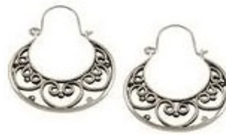
Silver earrings ref613