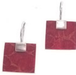
Silver and coral ref606