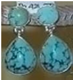
Turquoise stones ref627