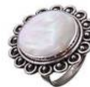
Sterling silver flower ring mother of pearl ref434