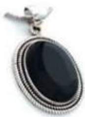
Silver sterling oval-shaped pendant black onyx Ref 311