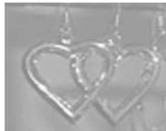
silver heart-shaped earrings ref618