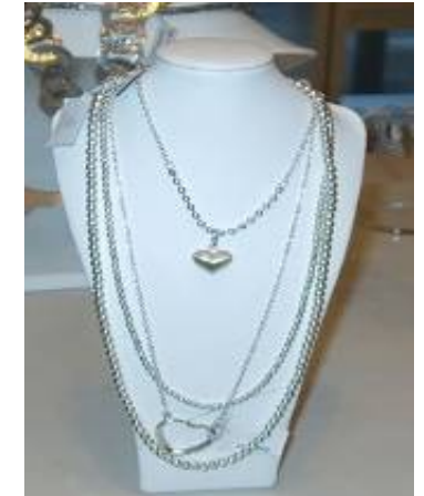
Silver necklaces ref SJ144 ref SJ145 ref SJ146 ref SJ147