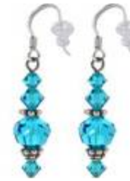
Turquoise stones ref604