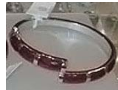
Sterling silver bangle garnet stones ref 214