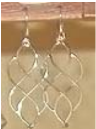
Silver earrings ref631