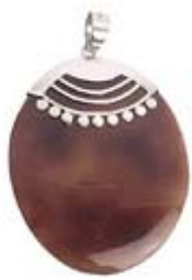
Silver sterling oval-shaped pendant brown sea shell Ref 321