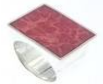
Sterling silver ring Red Coral ref 405