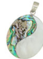
Silver sterling pendant resin and sea shell Ref 334